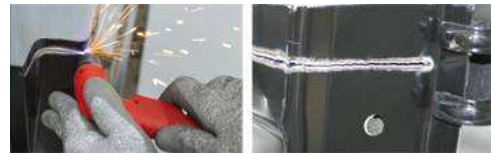
STEEL : 10 mm max ALU : 8 mm max (Speed = 9 cm / min at 30A)